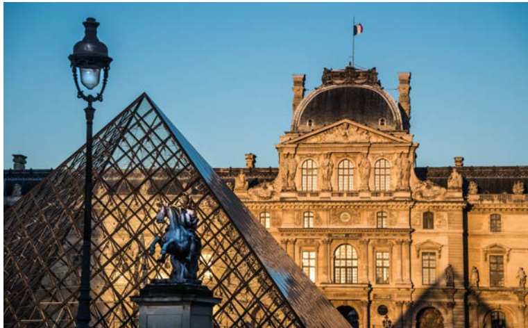
In the Louvre Palace, periods and styles have a continuing dialogue. The Clock Pavilion built during the Renaissance faces the famous Pyramid designed in 1989 by I.M. Pei.