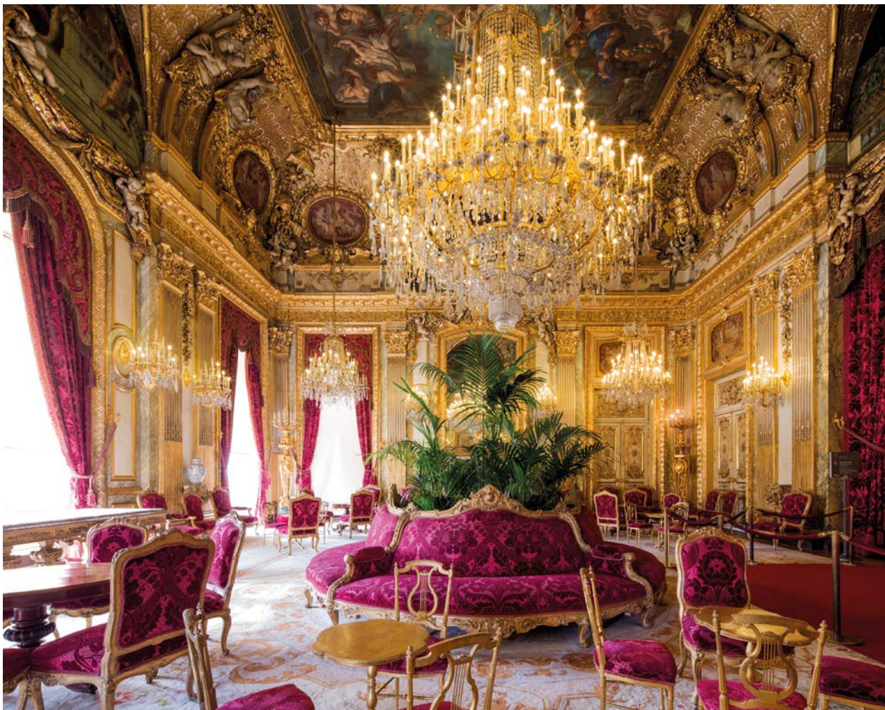
The large drawing room of the Napoleon III Apartments typifies the taste of the period for opulent interiors and is an exceptional record of Second Empire decorative art.