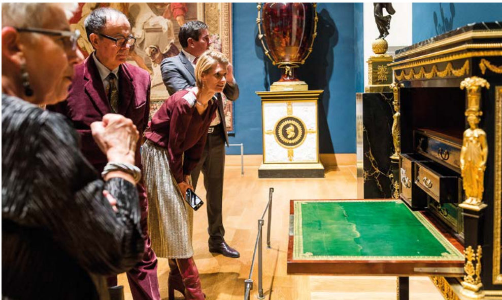
A private tour of the Decorative Arts Department for patrons.

Donors can create dedicated named funds that will support some specific projects. Financial and project reports are sent to them every year. Under French law, the Louvre Endowment can only finance missions and core projects of the Louvre (and no administrative expenditures).