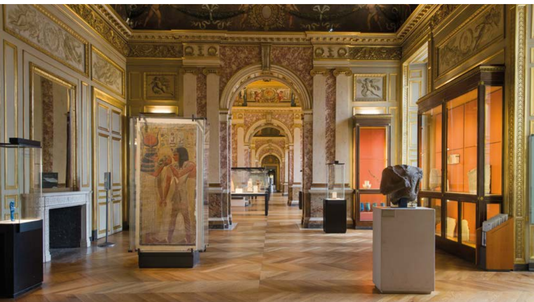
In 1827, King Charles X inaugurated eight new rooms dedicated to Egyptian and Greco-Roman antiquities. Today, these galleries still preserve the original layout of the nineteenth century.