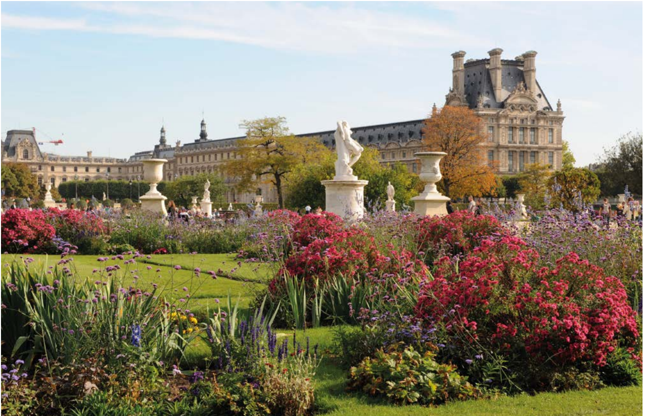
The Tuileries Garden was originally commissioned by Queen Catherine de Medici when she built the Palais des Tuileries in 1564. André Le Nôtre, the famous gardener of King Louis XIV, re-landscaped the gardens in 1664 to give them their current French formal garden style.