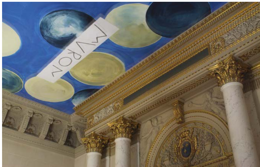
Cy Twombly, The Ceiling . The Louvre Palace has benefited from the intervention of great artists throughout its history and the musée du Louvre continues today this tradition of commissions from contemporary artists.

To date, more than $47 million has been committed to benefit the Louvre's eight curatorial departments as well as the Education Department, Auditorium and Louvre Endowment. Initiatives supported range from scholarly research to gallery renovations, exhibitions and educational tools, and also include contemporary art installations, restorations and acquisitions.