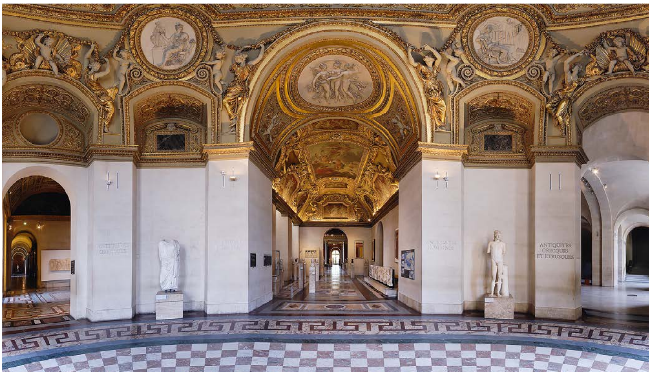
The names of the Louvre Endowment Fund’s major donors are engraved on the walls of the Rotonde de Mars for eternity.

The support provided by the 12-year-old endowment fund has proved to be stable over time. However, the financial challenges of the coming years, particularly the growing costs of maintenance and restoration, mean that