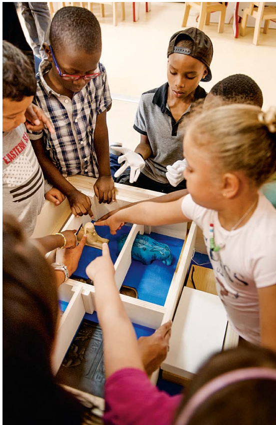
One of the dedicated funds within the Louvre Endowment contributes to developing the Louvre's activities outside its walls to reach underprivileged populations unfamiliar with the museum.