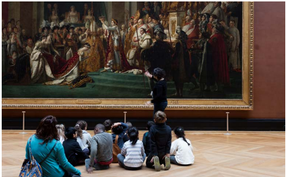
The Daru and Mollien rooms, commonly known as the salles rouges, or "red rooms", house the Louvre's greatest canvases of 19th-century French painting. Some of the masterpieces from Delacroix to David can be admired here, including the Coronation of French Emperor Napoleon I, which a group of children visiting the museum are looking at attentively.

The musée du Louvre is active in its exchanges with other museums, including frequent loans for exhibitions. Many important exhibitions have traveled from the Louvre to the United States, such as the recent exhibition on Mesopotamia in 2021 at the Getty in Los Angeles, on Vermeer in 2017 at the National Gallery in Washington, D.C and on Delacroix in 2018 at the Metropolitan Museum of Art.