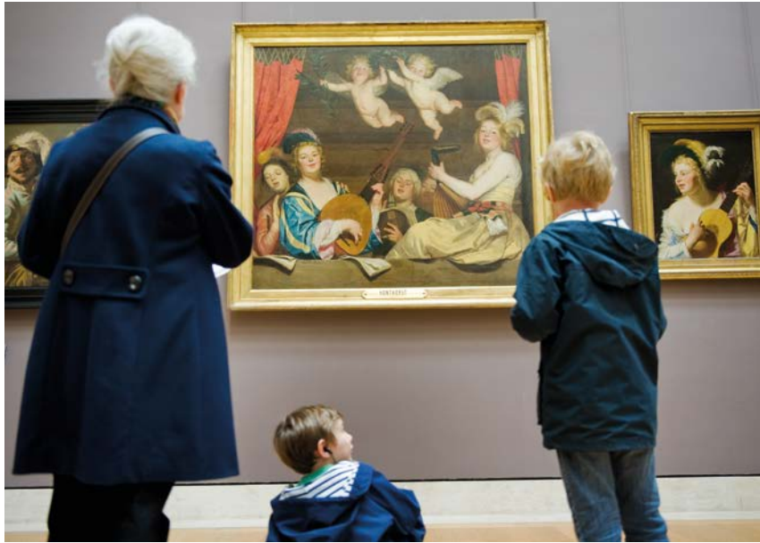
Educational programs for families are supported through dedicated funds within the Louvre Endowment Fund.

Further, an important component of the Pyramid Project, to improve the visitor experience, is the creation of new labels for all of the 35,000 works of art on display at the Louvre in English and French, and the installation of new information panels in French, English and Spanish. Access is also facilitated by the digitization of the collections, which has enabled people to learn about the Louvre's fantastic resources.