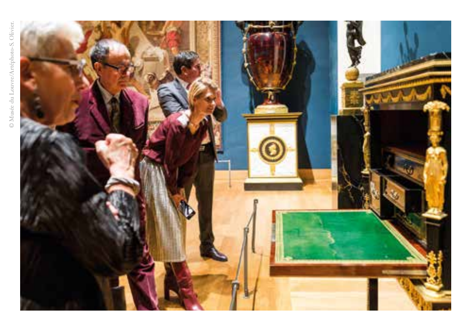
A private tour of the Decorative Arts Department for patrons.