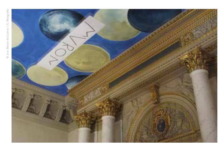
Cy Twombly, The Ceiling . The Louvre Palace has benefited from the intervention of great artists throughout its history and the Musée du Louvre continues today this tradition of commissions from contemporary artists.

To date, more than $32 million has been committed to benefit the Louvre's eight curatorial departments as well as the Education Department, Auditorium and Louvre Endowment. Initiatives supported range from scholarly research to gallery renovations, exhibitions and educational tools, and also include contemporary art installations, restorations and acquisitions.