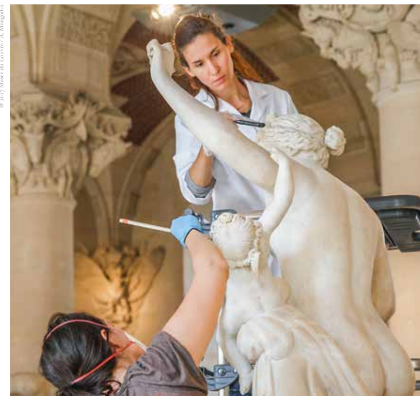
The Louvre Endowment Fund contributes through collective and dedicated funds to the preservation of the Louvre's collections and Palace.

The curators of the Louvre are welltrained specialists, including many leading experts in their fields. They conduct ongoing research on the collections and regularly publish articles and books in association with the Louvre's publication service that contribute to the advancement of knowledge on art history and archaeology. The Louvre Palace houses a laboratory, the C2RMF, for the study and restoration of its collections which contains the only electrostatic accelerator in the world devoted to the study of works of art. The C2RMF conducts scientific studies for the Louvre and other French museums, frequently collaborating with international museums. The Auditorium of the Louvre, built by I.M. Pei during the construction of the "Grand Louvre," accommodates more than 400 people. It offers conferences and round-table discussions aimed at the scholarly community and the general public, alike highlighting the Louvre's research programs.