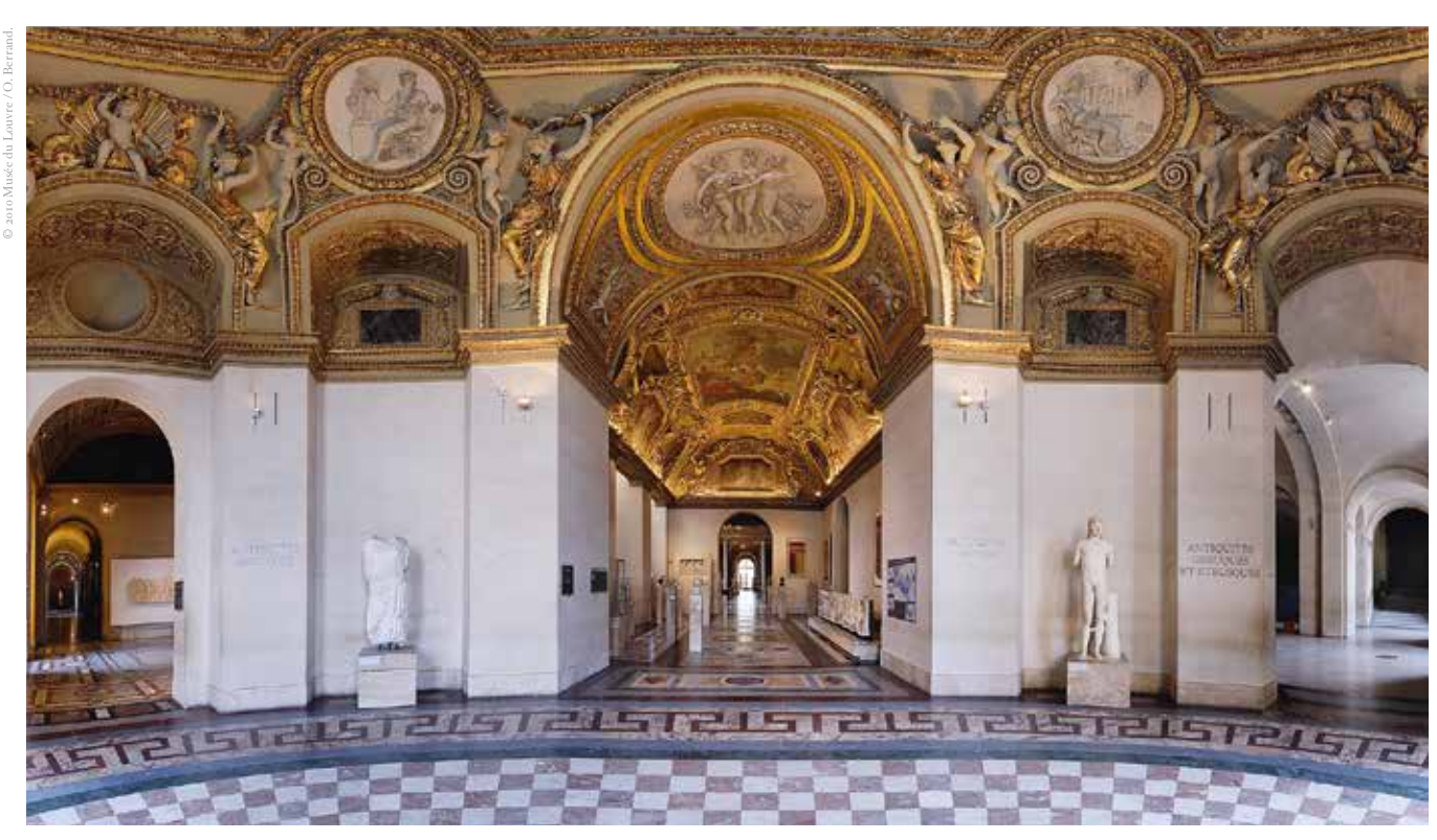
The names of the Louvre Endowment Fund's major donors are engraved on the walls of the Rotonde de Mars for eternity