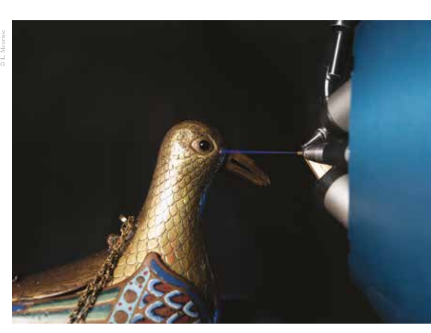
Analysis of the Eucharistic dove (Limoges enamels from the thirteenth century) in the particle accelerator of the C2RMF under the Louvre. Two dedicated funds within the Louvre Endowment Fund support research on the Louvre's collections.