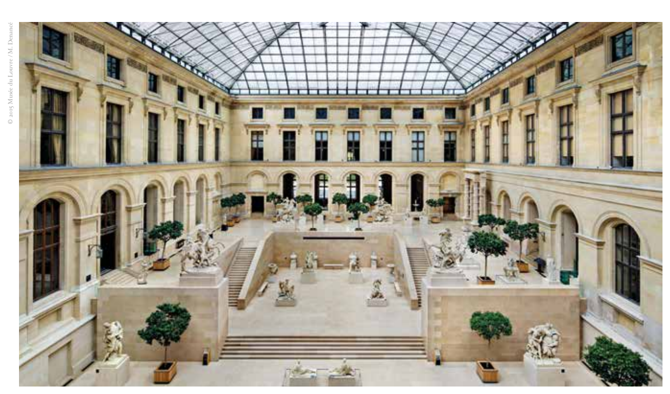
Originally a courtyard in the classic sense, Cour Marly was covered with a roof and transformed into an indoor sculpture garden. Most of the sculptures come from King Louis XIV's Chateau de Marly

The Louvre is an international museum, a destination for people from around the globe. It is committed to sharing its collections with the world through cultural exchanges between countries, and even through the creation of new museums, such as the Louvre Abu Dhabi, which embodies a new model of dialogue between cultures. The Musée du Louvre is active in its exchanges with other museums, including frequent loans for exhibitions. Many important exhibitions have traveled from the Louvre to the United States, such as the recent exhibitions on Vermeer in 2017 and Delacroix in 2018 at the National Gallery in Washington, D.C. and the Metropolitan Museum of Art, respectively.