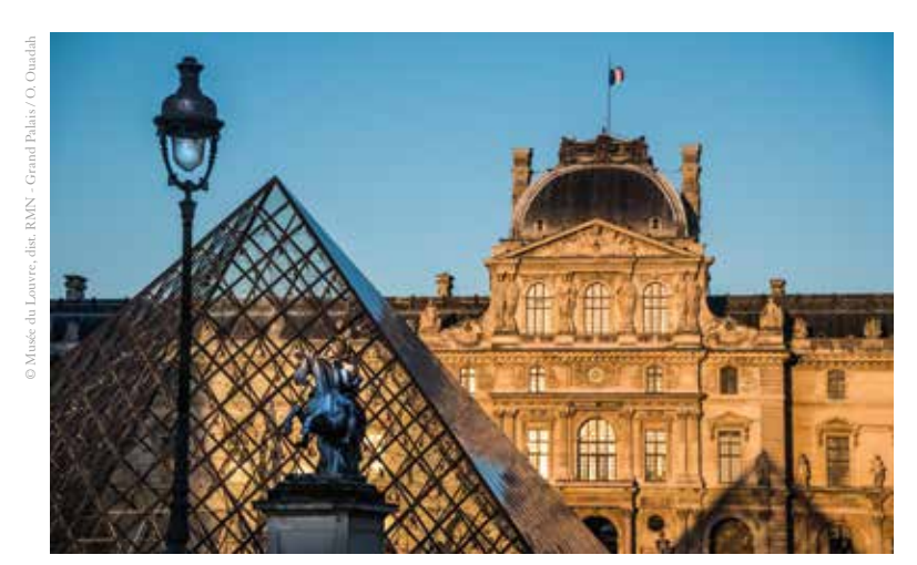
In the Louvre Palace, periods and styles have a continuing dialogue. The Clock Pavilion built during the Renaissance faces the famous Pyramid built in 1989 by I.M. Pei.