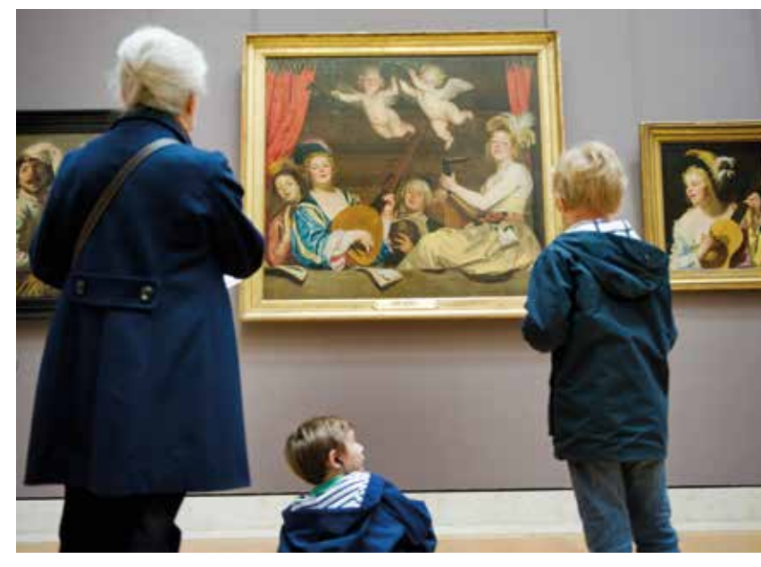
Educational programs for families are supported through dedicated funds within the Louvre Endowment Fund.

Further, an important component of the Pyramid Project, launched in 2014 to improve visitor experience, is the creation of new labels for all of the 35,000 works of art on display at the Louvre in English and French, and the installation of new information panels in French, English and Spanish. Access is also facilitated by the digitization of the collections, which has enabled people to learn about the Louvre's fantastic resources.