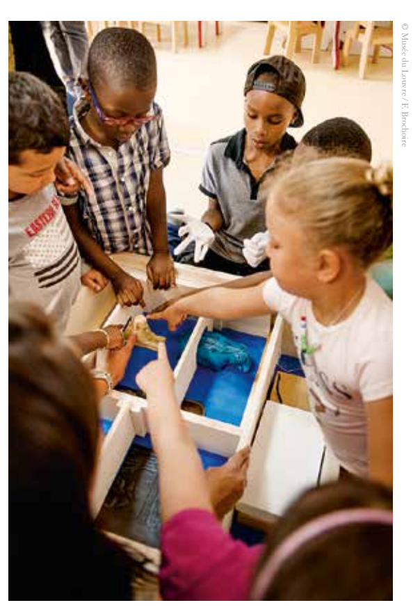
One of the dedicated funds within the Louvre Endowment contributes to developing the Louvre's activities outside its walls to reach underprivileged populations unfamiliar with the museum.