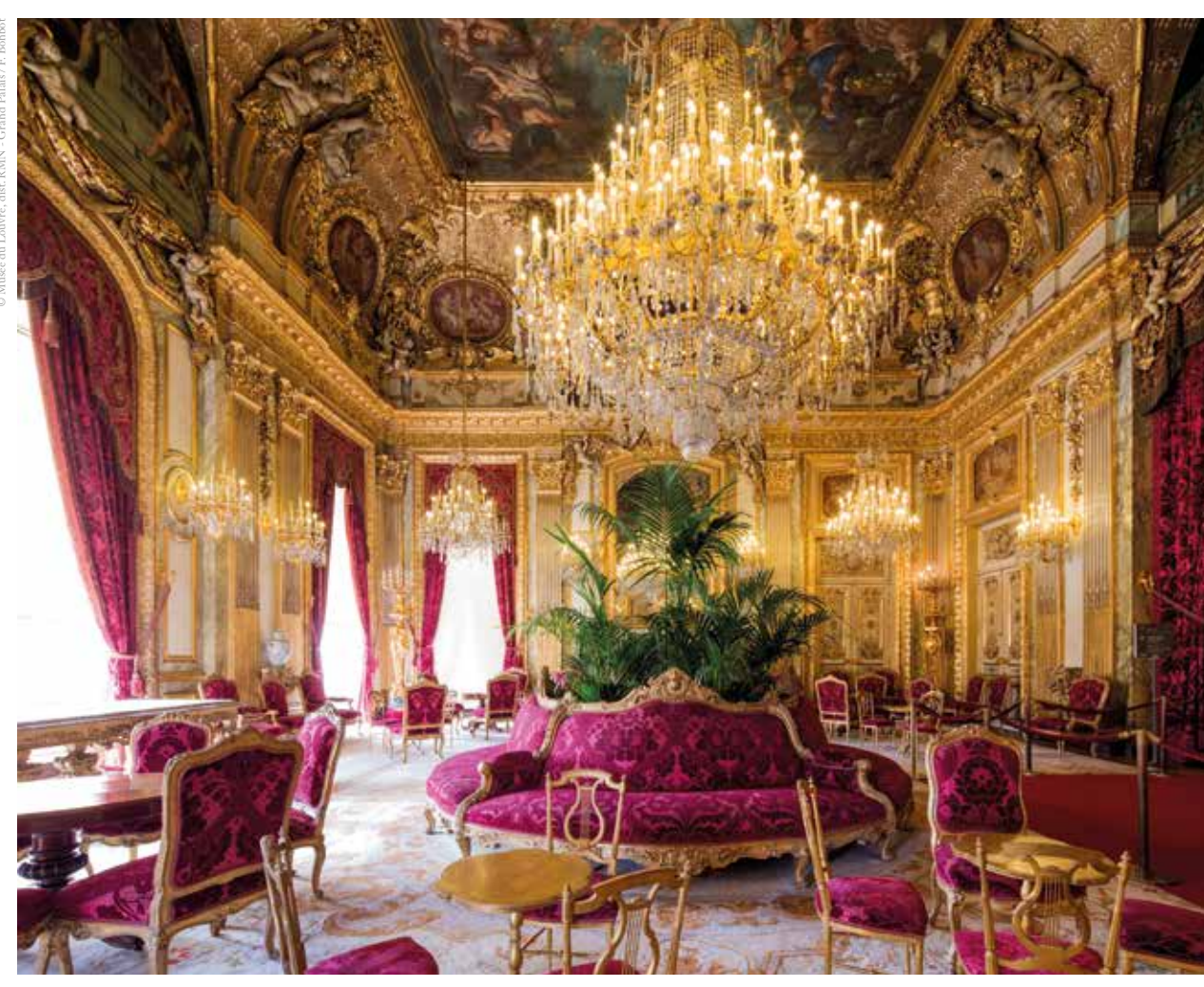
The large drawing room of the Napoleon III Apartments typifies the taste of the period for opulent interiors and is an exceptional record of Second Empire decorative art.

Today, the Louvre runs an ambitious acquisitions program to expand and complete its collections and to present the most beautiful examples in the history of art to the public. More than 100 works of art join the Louvre's collections each year. In 2016, the portraits of Maerten Soolmans and his wife Oopjen Coppit, two masterpieces painted by Rembrandt in 1634, were jointly acquired by the Louvre and the Rijksmuseum in Amsterdam. The paintings are the only examples of full-length portraits by the greatest painter of the Dutch Golden Age.