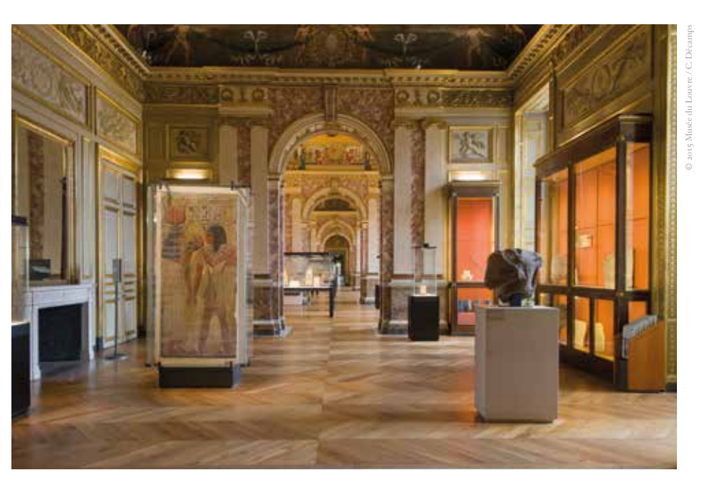
In 1827, King Charles X inaugurated eight new rooms dedicated to Egyptian and Greco-Roman antiquities. Today, these galleries still preserve the original layout of the nineteenth century.