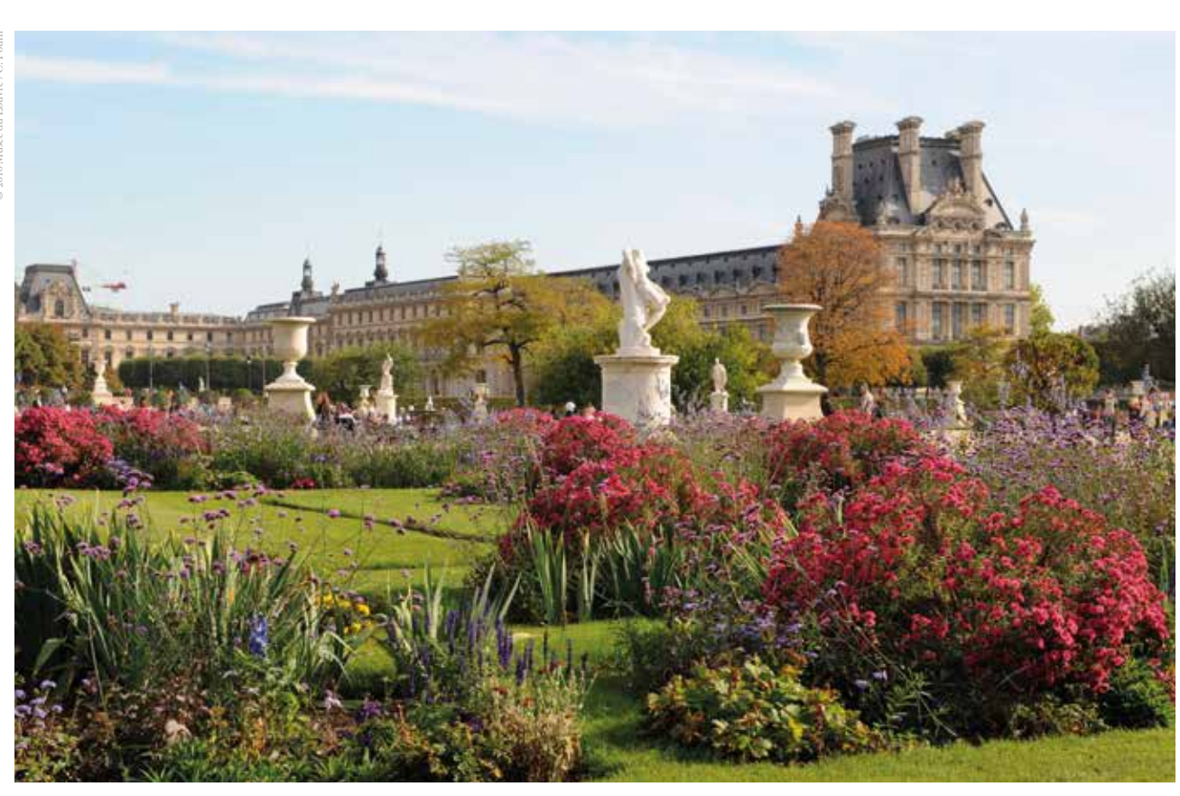
The Tuileries Garden was originally commissioned by Queen Catherine de Medici when she built the Palais des Tuileries in 1564. André Le Nôtre, the famous gardener of King Louis XIV, re-landscaped the gardens in 1664 to give them their current French formal garden style.